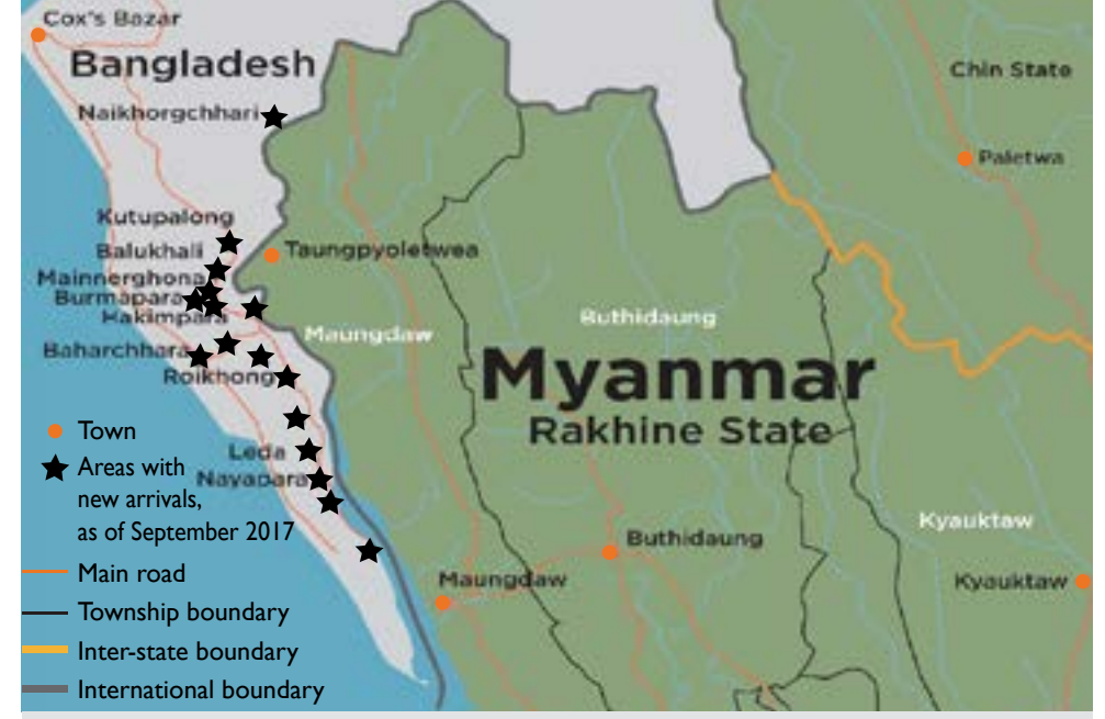
Figure 1: Border areas between Myanmar and Bangladesh, with Rohingya refugee arrivals as of September 2017.

21 networks run according to a full-time class schedule, teaching 5 or 6 days per week, while 6 others teach part-time, in the early mornings and evenings. Student attendance rates are generally high and consistent, with most respondents reporting an absentee rate of 5 to 10 percent. The most common reasons for truancy are children being busy with tasks such as collecting food rations or working odd jobs.